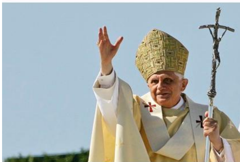
Pope Benedict XVI waves to pilgrims at the end of a papal Mass at Islinger field, in Regensburg, southern Germany, on Sept. 12, 2006.